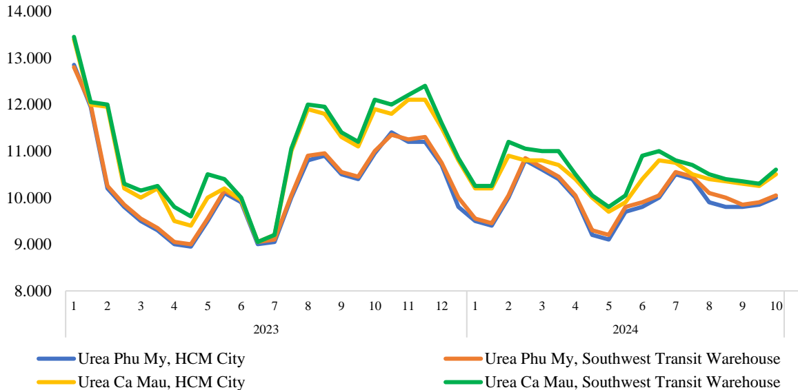
Vietnam's Urea price in 2023-2024